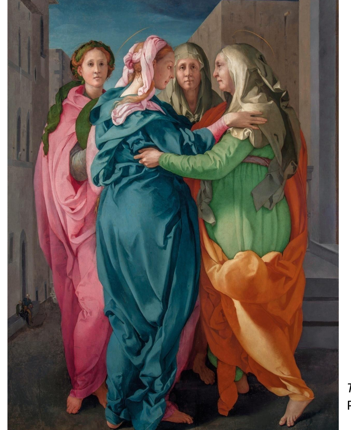
The Visitation by Pontormo (c.16<sup>th</sup>)